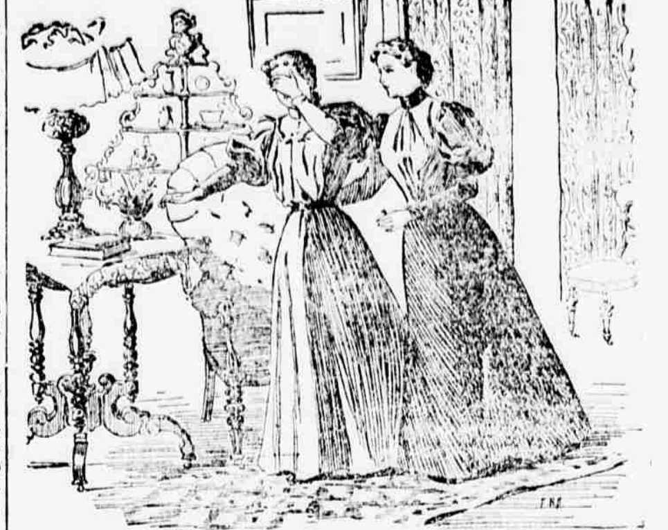
SHE WAS BLIND.

Will heal the inflammation of the throat and lungs and nourish and strengthen the body so that it can throw off the disease.