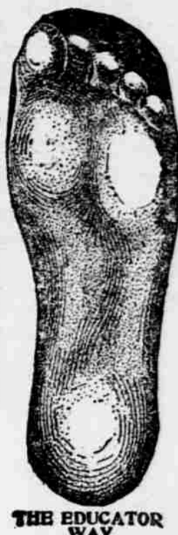
THE EDUCATOR WAY

EDUCATOR SHOES are made of finest selected leathers. Call and examine them and you will be convinced that they are the best shoe made to keep the growing foot in its natural shape. Ask for EDUCATORS.