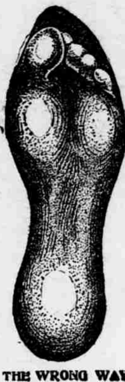
THE WRONG WAY

You should realize the importance of allowing the child's foot, while growing, to take its natural shape.