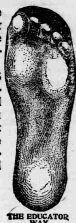
THE EDUCATOR WAY

You should realize the importance of allowing the child's foot, while growing, to take its natural shape. EDUCATOR SHOES are made of finest selected leathers. Call and examine them and you will be convinced that they are the best shoe made to keep the growing foot in its natural shape. Ask for EDUCATORS.