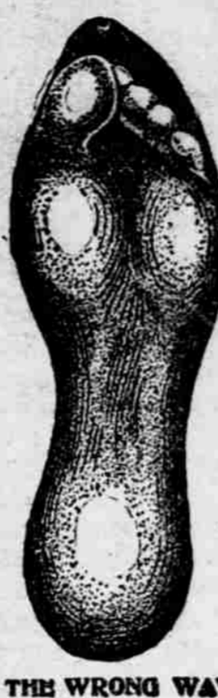
THE WRONG WAY

You should realize the importance of allowing the child's foot, while growing, to take its natural shape. EDUCATOR SHOES are made of finest selected leathers. Call and examine them and you will be convinced that they are the best shoe made to keep the growing foot in its natural shape. Ask for EDUCATORS.