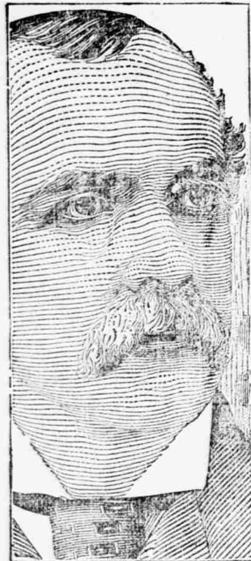
Ex-Senator M. C. Butler.

Dyspepsia is often caused by Catarrh of the Stomach—Peruna Relieves Catarrh of the Stomach and is therefore a Remedy for Dyspepsia.