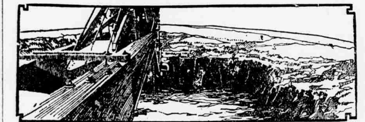
GIANT DREDGE EATING CANAL THROUGH FLORIDA'S MUCK LAND.

The Hideyoshi's boats cruised around until after dawn, but succeeded in making few rescues. Another steamer stood