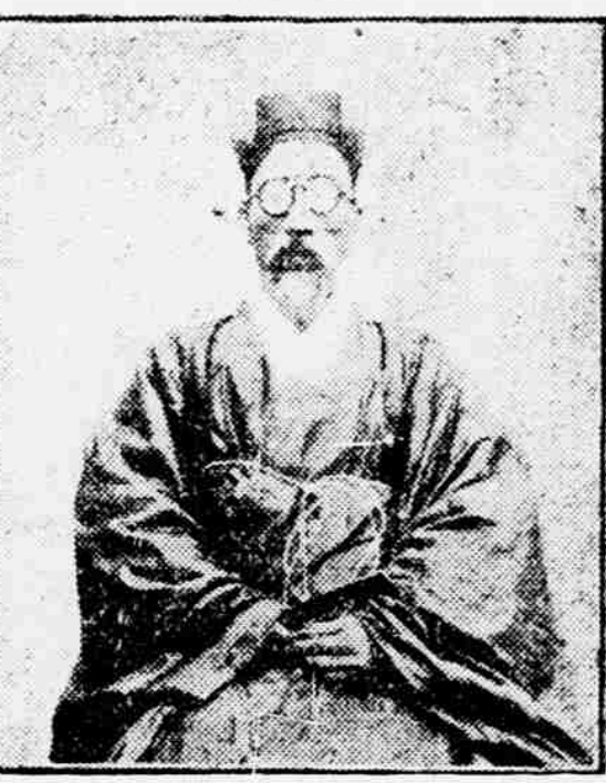
EMPEROR OF KOREA.

Russia has warned the United States that behind the Japanese plan to have the Emperor of Korea visit Tokio is a plot to keep the Emperor in Japan and where the fleet was sighted it had the put on the throne in Korea some one who will be ruled absolutely by the Japanese, making Korea virtually a Japanese possession. Russians claim the Japanese have gone so far as to erect a palace in Tokio in which the Korean Emperor is to live. The Japanese minister at Washington denies that there is any plan to detain the Emperor in Japan.