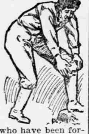
Pain in left knee

Irritation of the bladder shows that the kidneys are out of order. Delay in prompt attention often causes serious complication. Relieve and cure sick kidneys and ward off dangerous diabetes, dreaded dropsy and Bright's disease, by using Doan's Kidney Pills. They begin by healing the delicate membranes and reducing any inflammation of the kidneys, and thus making the action of the kidneys regular and natural.