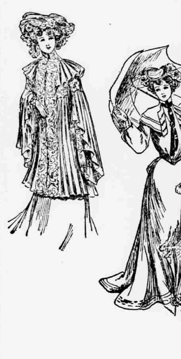
NEW IDEAS IN GOWNS AND COATS.

Next winter, apparently, the reign of smooth surfaced cloths will be over. It seems hard to believe, for the better examples of these weaves have been things of beauty, aside from tests of wear, from which they came off well, as a rule. But handsome as these goods are in the piece, and nicely as they make up, the signal has been given for a change, and already the better grades of fall woollens are rough faced, zibeline and astrakan effects abounding. Some of these woolly goods make fine street suits, and there is no doubt but that they are to be the stylish standard. In the methods of making no surprising change is