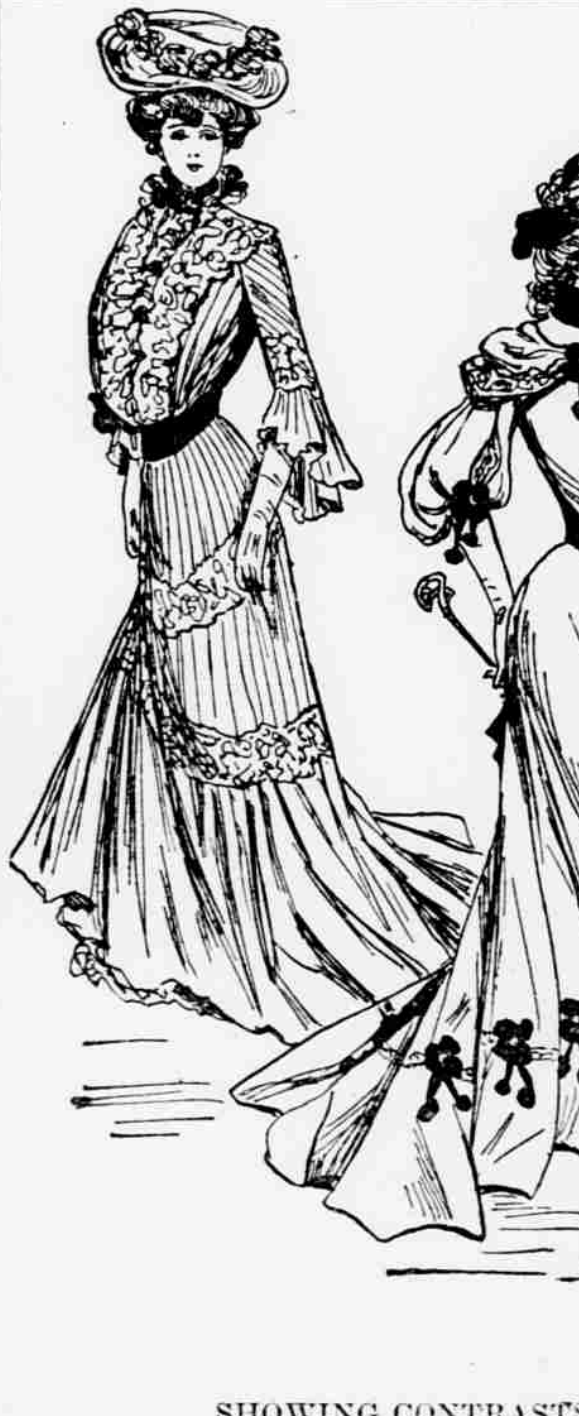
SHOWING CONTRASTS IN MATERIALS.

lar. The other was tan cloth and Persian embroidery, with lace sleeve puffs. Altogether, there is an outlook of much variety in wraps, with a good chance for everyone to be suited if only the price makers are kind. The use of several chiffon veilings in varying tints under a sheer fabric is more and more followed for evening gowns, though it needs an artist to give just the right touch. Shot voile or voile de soie over a different color also makes a lovely color harmony. Black mousselines scattered over with faint shadowy flowers makes a charming gown for evening wear. One handsome gown seen had a foundation of lining of white silk, veiled first by pale yellow chiffon, then by pale