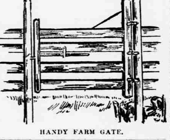
HANDY FARM GATE.

Good Farm Gate. A heavy gate that is opened a number of times daily is apt to sag in a short time if not well braced. An excellent way of overcoming this fault is shown in the illustration. The posts are longer than those ordinarily used, and are set a foot deeper in the ground than fence posts generally. Heavy flat stones are placed about the bottom of the post, to which the gate is hung, and these stones are braced on either side by stout oak stakes. These stakes are driven so that the tops are just below the surface of the ground. Three strong hinges are used to hang the gate and a strong rod of iron is fastened to the upright of the gate and to the top bar. This helps greatly in keeping the gate from warping or "racking" out at the joints. The latch fastening, though simple, is effective. A slot is cut through the front upright of the gate