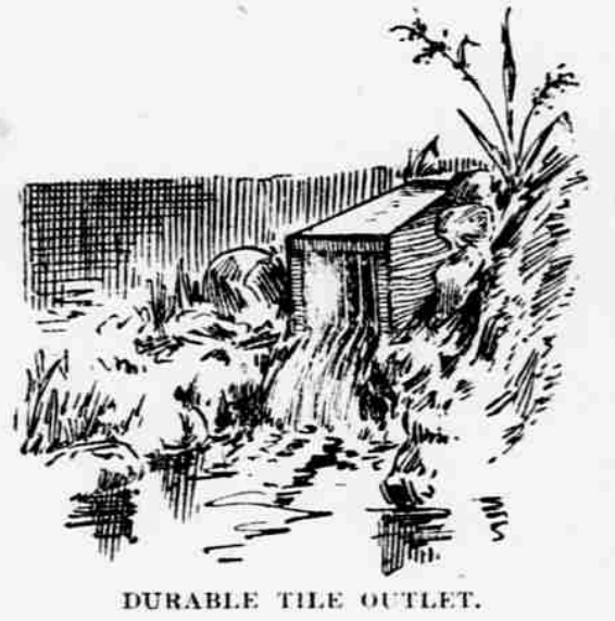
DURABLE TILE OUTLET.

The outlet should also be kept clean of roots and bars of netting so placed that the vermin may be kept out. If this is done and the tile properly laid,