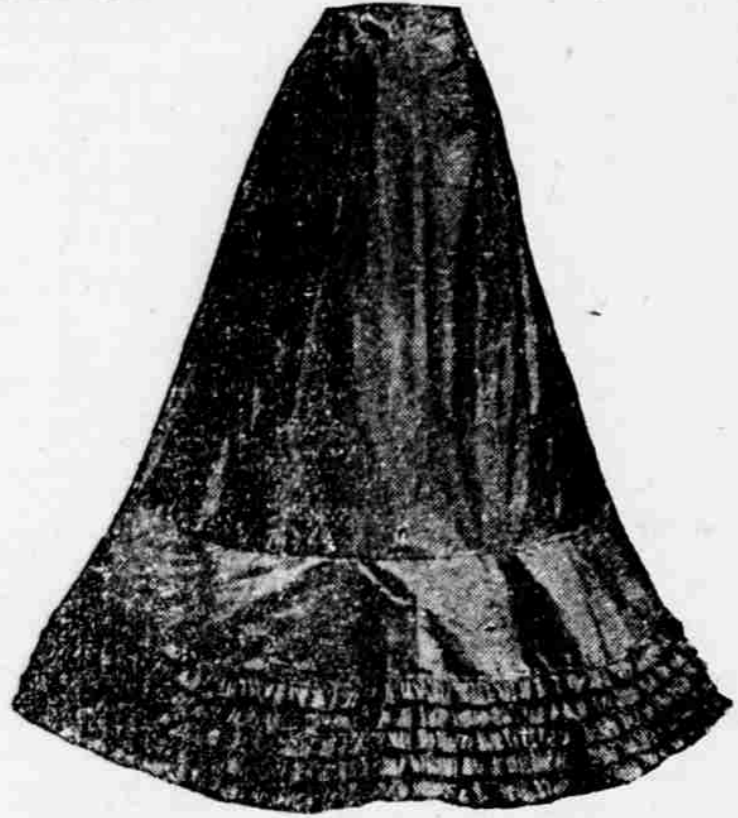
They are cut to fit, having the glove tightness above a sloping hip and the quality, pretty flaring away beneath which give the wearer an unimitable grace.

Colors:--Cerise, Cardinal and Black. THE RED FRONT.