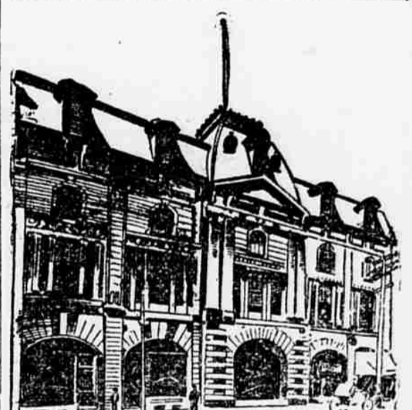
LONDON, ONT., CITY HALL.

It now appears that there were but twenty deaths from the collapse of the floor in the London, Ont., city hall, al-