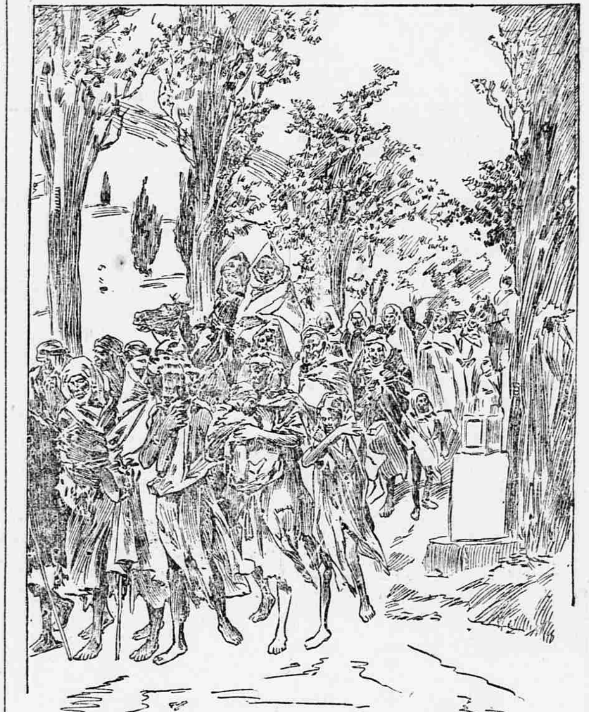
HORDES OF STARVING PEOPLE SWARM THE ROADS IN INDIA.

And this slime, foul with animal and vegetable putrefaction, the people must strange people living in the hotbed of na- | drink as the horrors of thirst are added to tions, speak a language which in some of I those of hunger. Up from the dry jun-