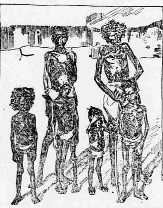
STARVING NATIVES AT JUBULPORE.

The jungles near which they make their villages are full of fierce quadrupeds and yet more deadly reptiles. Tigers kill and devour them, cobras sting them to such an extent that the deaths from this cause alone run fato the thousands every year. The deadly miasma of the marsh and the jungle saps their vitality until they are