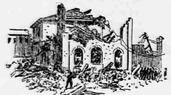
EAST. ST. LOUIS CITY HALL.

Bruised and torn and bleeding, staggering from the force of the blow, but still their homes to reassure loved ones. All reliant and confident in her own strength, felt that a dreadful calamity had occurthe city of St. Louis is standing in the red, but none could say the extent of it. view of hundreds of thousands of visitors, a beautiful picture even in her misery and tent there was not a man who knew what pain. Though 200 of her children were had been accomplished by the terrible torn from her by the merciless wind, and | wind. scores are lying in the hospitals on beds of agony, she is rallying her superb re-