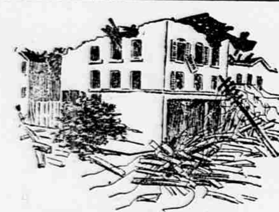
SCENE IN HICKORY STREET.

Birth of the Tornado. On that fateful Wednesday afternoon the clouds formed in conclave over St. Louis. For months, weeks they had been hovering in an atmosphere that made