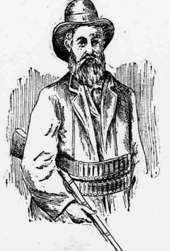
GEN. GEORGE P. J. JOUBERT.

from Holland and located at Uniontown, where he was born in 1841. When 14 years old he went to Holland and from there to South Africa. At the outbreak of the civil war he returned to America and served in the navy under Admiral Dupont. He was afterwards captain of a colored company under Gen. Weitzel. When the war was over he went to Holland again, and next to South Africa. In 1881 he was a plain farmer when the Boers revolted. He led a handful of Dutch warriors, and defeated the British army at Ma-