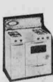
Roper Freestanding Units

Fall and Winter always calls for more cooking, and it can be so easy with a modern Roper Gas Range doing the work for you. Once you've made the change, you will wonder how you managed without the "OVEN WITH A MIND" that cooks and keeps foods hot for serving... The AUTOMATIC TOP BURNER, that controls cooking temperatures... plus countless other Roper Gas Range features.