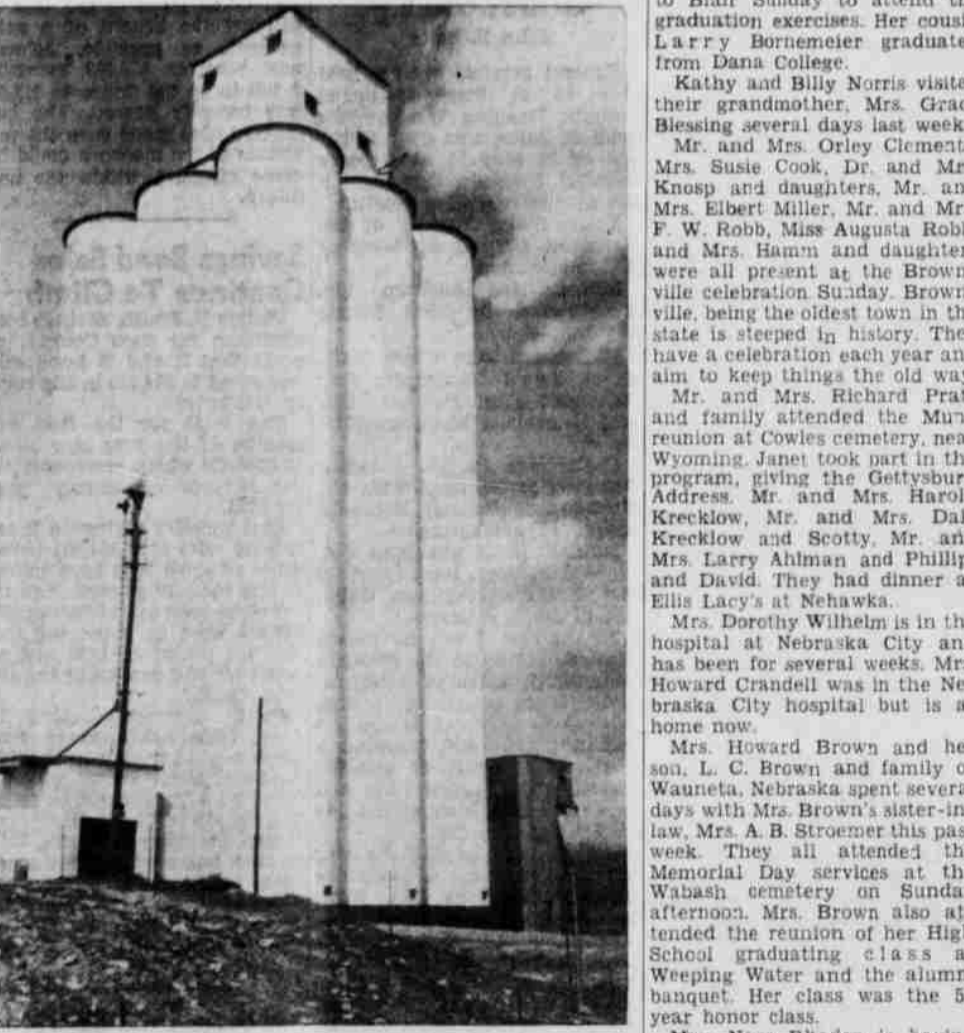
STORED—Soon the wheat is elevated into one of the cluster of silos which combined hold 265,000 bushels. The grain is shipped by river barge, most going to New Orleans for export. More than 2 million bushels of wheat followed this course through the Rock Bluff terminal the past year.