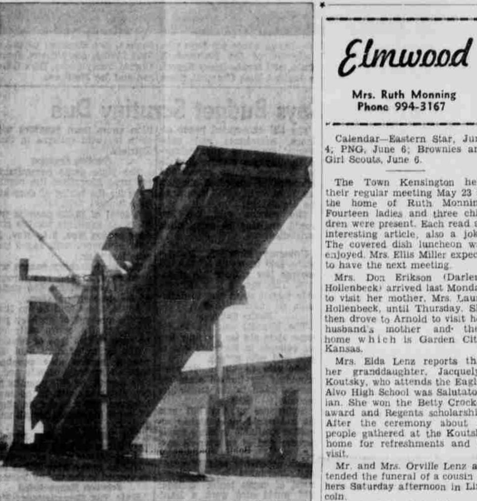
UP AND OUT!—The load is weighed quickly and then unloaded in a few minutes as a huge hydraulic hoist tips the entire truck and tractor to empty the wheat into an underground bin . . .