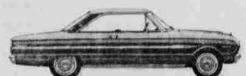
Brand-new Falcon V-8 Sprint Hardtop... the car that stole the show in the Monte Carlo Rally! V-8 standard!

Who else but Ford—pioneer in V-8 performance—would bring you 5 great new V-8 engines* all at once! There's new V-8 "go" all through the line! For instance, Thunderbird horsepower goes up to 425 in the new '63 1/2 Super Torque Ford! In Fairlane, there's a new V-8—271 hp! Or come feel the fun in a V-8 Falcon—any Falcon! ** Add up our V-8's... 11! That's right—11 V-8 choices for you! Nobody else comes close!