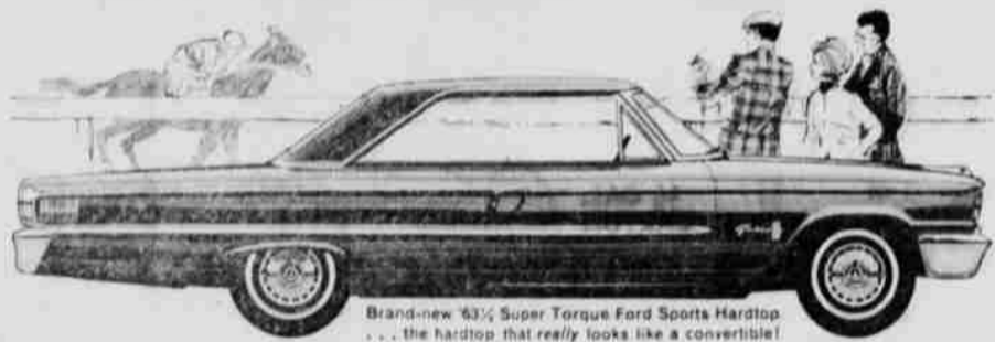
Brand-new '63 1/2 Super Torque Ford Sports Hardtop... the hardtop that really looks like a convertible!

Come sample the liveliest line-up of new V-8 horsepower in Plattsmouth.