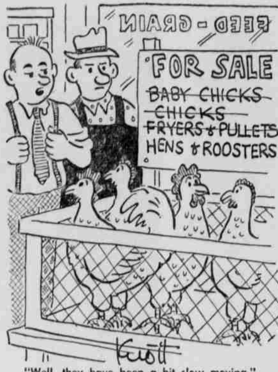
"Well, they have been a bit slow moving."