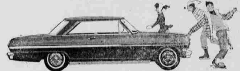
CHEVY II NOVA 400 SPORT COUPE