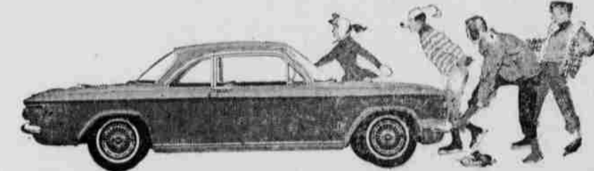
CORVAIR MONZA CLUB COUPE