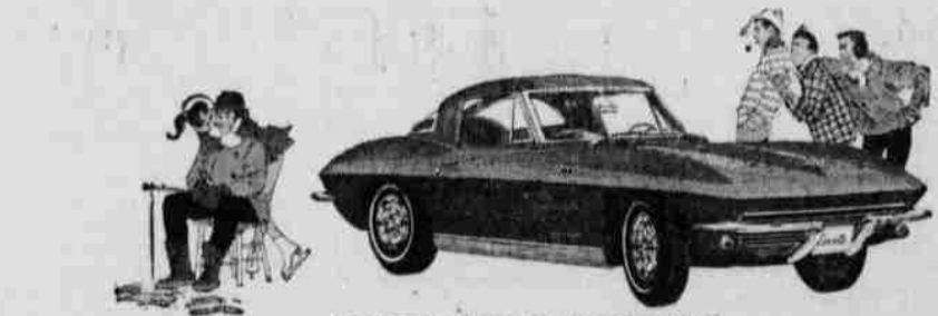
CORVETTE STING RAY SPORT COUPE

Now—Bonanza Buys on four entirely different kinds of cars at your Chevrolet dealer's