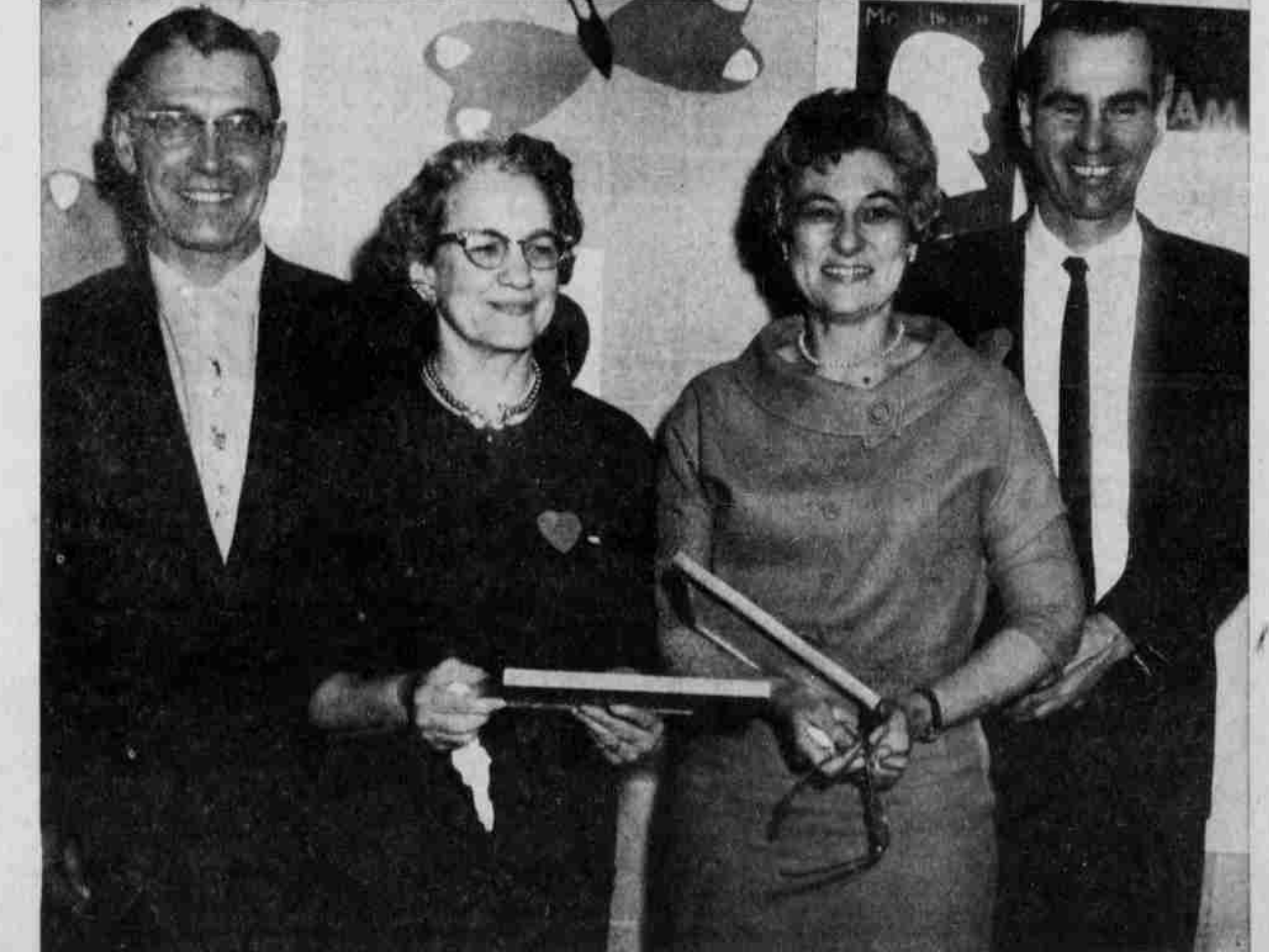
this award he has developed good citizenship through the developing of Spiritual Life work with youngsters and in the schools, Mrs. developing of Spiritual Life women were presented Life Memberships by Columbian PTA Tues- has been active in many activities in Plattsmouth.