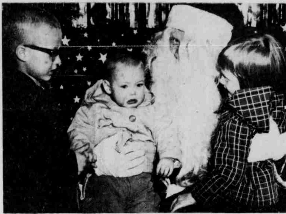
INTERVIEW'S OVER! —The visit with Santa Claus at Santa Land in Plattsmouth was all right for a time for this wee caller, with big Brother and Sister to lend moral support. But after a time it began to pale. Heavens! That man is hirsute!

Good Advice It's much better to sit tight than attempt to drive in that condition.—WOW Magazine.