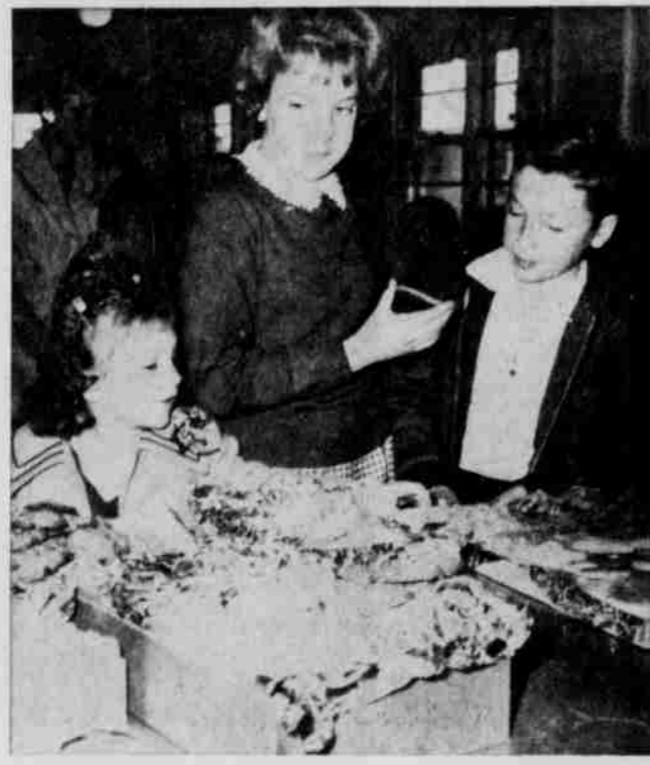
CHOW TIME —There were a variety of tempting Christmas cookies and other goodies for lunch. . . . . Three youngsters contemplate their choice of treats.