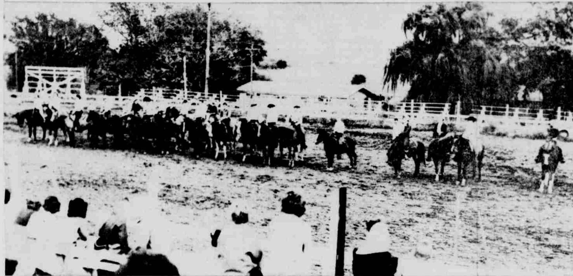
YOUNG HORSEMEN COMPETE—A total of 41 riders competed in the All-Junior Horse Show here Sunday. The group is shown shortly after the Grand Entry at the Sales Barn Arena.