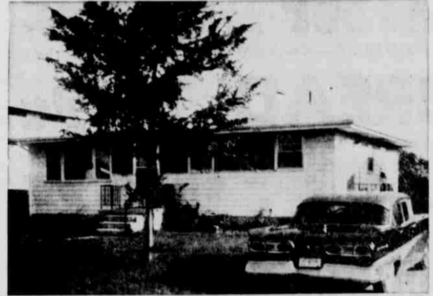
This duplex has 2-3 bedroom units, and is built on a lot 50x140 ft. Present rental income $165.00 per month.