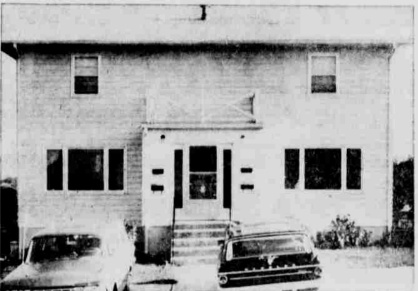
This 4-Plex has 4-2 bedroom units and is built on a 50 ft. by 140 ft. lot. Present rental income $300.00 per month.

ALL ABOVE APARTMENTS HAVE BUILT-IN UTILITIES AND EACH UNIT HAS SEPARATE UTILITIES