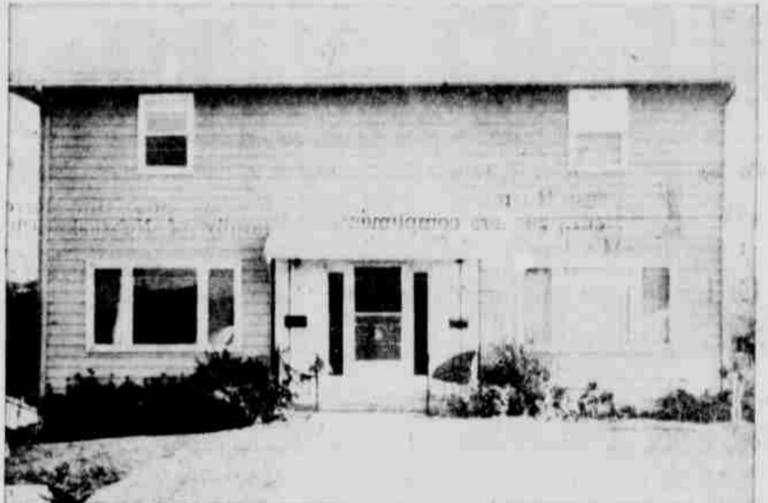
Duplex with 2-2 bedroom units, full basement on lot 50 ft. by 140 ft. Present rental income $210.00 per month.