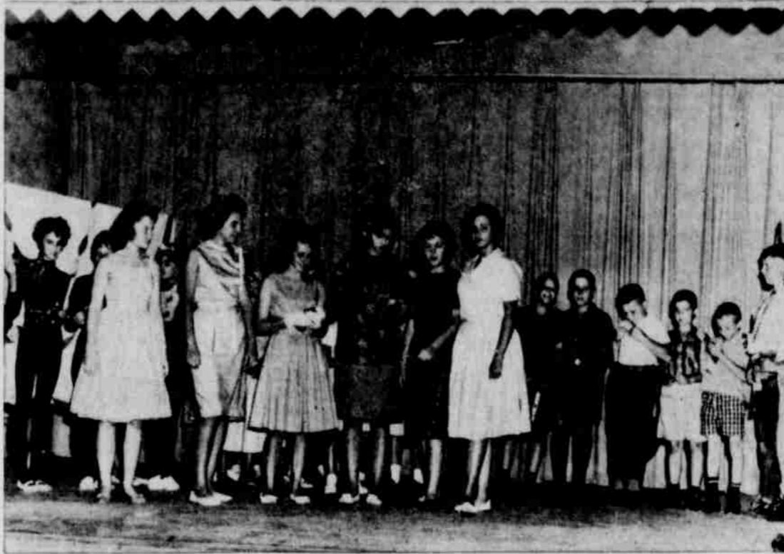
SHARE-FUN ENTRIES —Entries in the Share-The-Fun Contest for county 4-H'ers last weekend at the Ag Auditorium in Weeping Water.

A Classified Ad in The Journal cost as little as 50 cents.