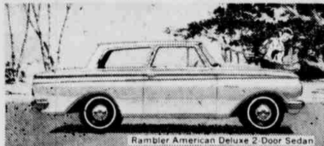
Rambler American Deluxe 2-Door Sedan

Open-air best seller—lowest price. Smart, sparkling, spirit and lively performance. 125 HP engine. With power top standard it costs less than any other U. S. convertible—even those with manual tops. No wonder it's one of America's fastest-selling 6-cylinder convertibles. Solidly and lastingly Rambler with rattle-free Single-Unit construction. $51 22 * per month