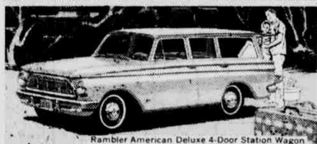
Rambler American Deluxe 4-Door Station Wagon

America's lowest-priced car. The "400" version with standard transmission got most miles per gallon of any car in '62 Mobil Economy Run. $40 34 * per month