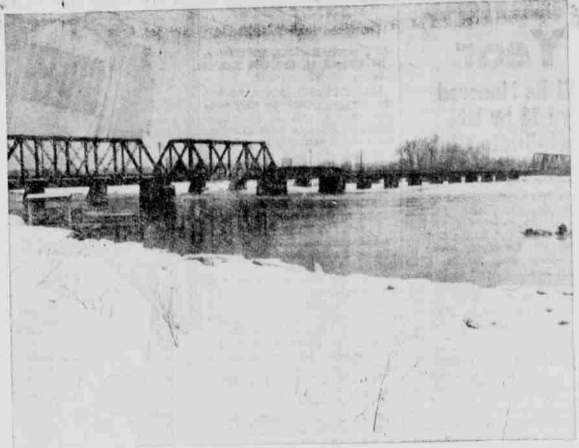
LOTS OF WATER UP ABOVE—The Platte River looked like this the other day just above the U.S. 73-75 bridges north of here, but the question was: how long? Upstream for some 315 miles was lots of snow, in some areas as much as