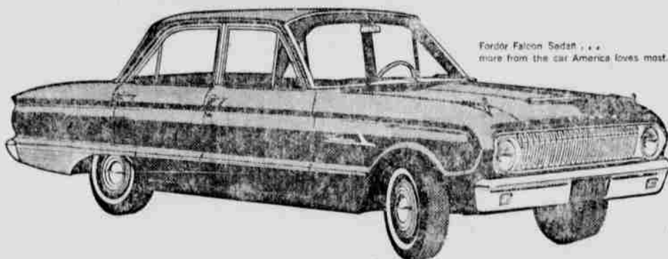
Ford Falcon Sedan... more from the car America loves most.

FALCON IS OUTSELLING THE OLD "COMPROMISE" COMPACTS WITH THE FAT PRICE TAGS! FALCON IS OUTSELLING THE NEW "NUMBER II, ME-TOO" COMPACT. FALCON IS OUTSELLING EVERY OTHER COMPACT FOR THE THIRD YEAR IN A ROW... BECAUSE FALCON IS BETTER THAN EVER, GREATER THAN EVER, 62 WAYS NEW FOR '62!