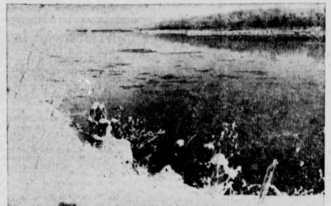
TIME AND THE RIVER—The old year was fast slipping away when this shot of the impetuous Missouri River was taken this week. There may be a little more ice on the river come one New Year's Day or another but the Mo just keeps flowing along. The river had not been frozen over this winter at the time photo was taken.