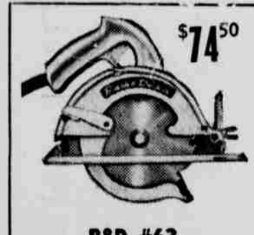
B&D #63 HEAVY-DUTY SAW

leavy Puty " Prill $59.95 SWATEK HARDWARE