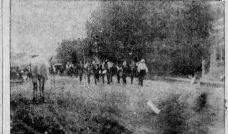
THE FAIR PARADE proceeded along Main Street in Nehawka and was of much interest to Dobbin keeping a sharp eye on the band.