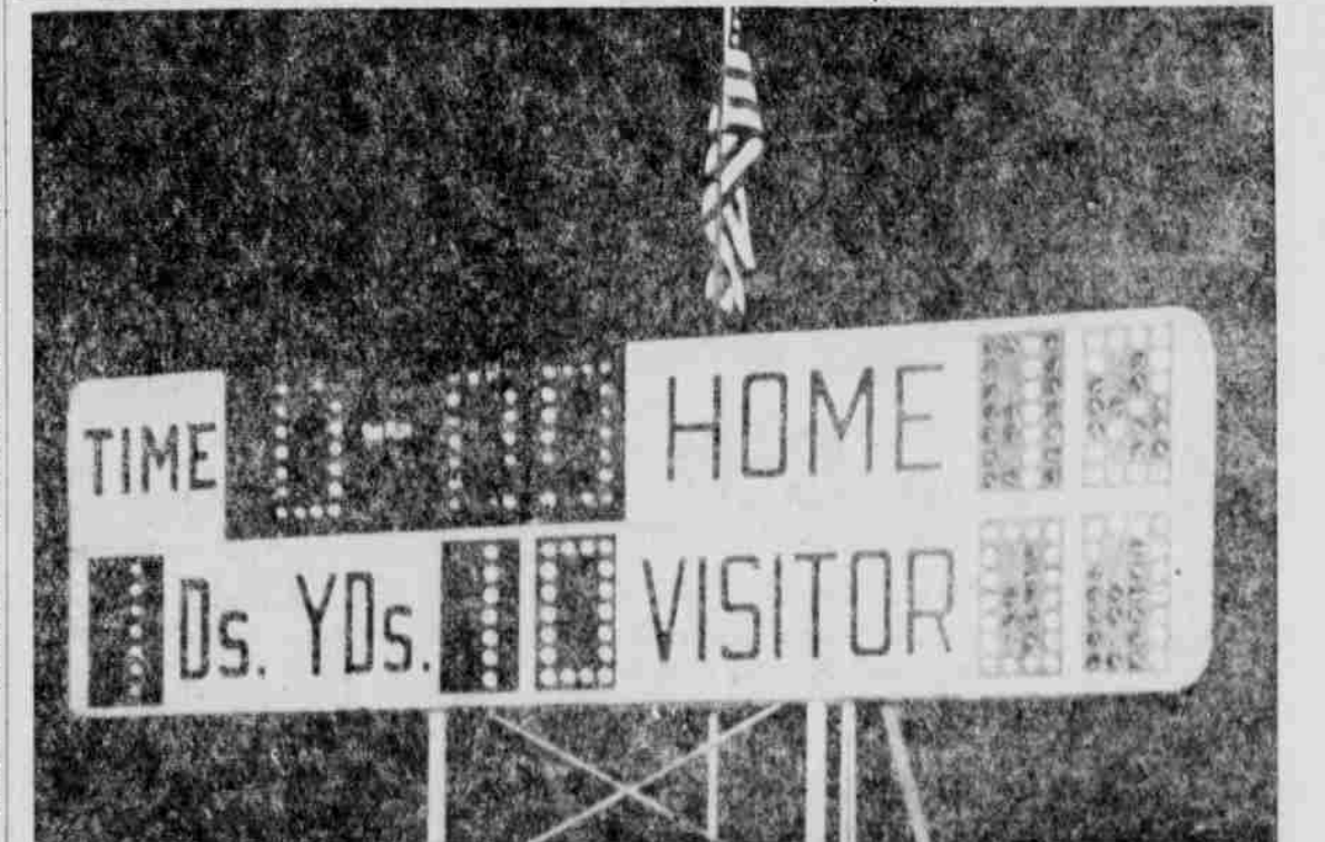
YEA!!!—The cause of a lot of happiness here Friday night was the outcome of the Plattsmouth-Falls City football game, the 12-7 score for Plattsmouth indicated on the scoreboard.

The girls told police they had intended to go to California.