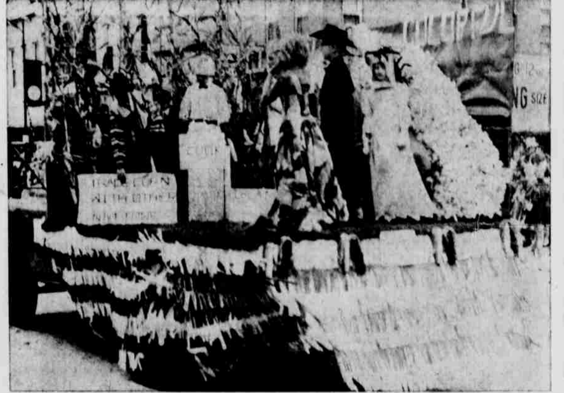
NO. 3 FLOAT —Corn's importance in the third prize winning float of the rural schools division of Friday's parade, entered by Dist. 88.