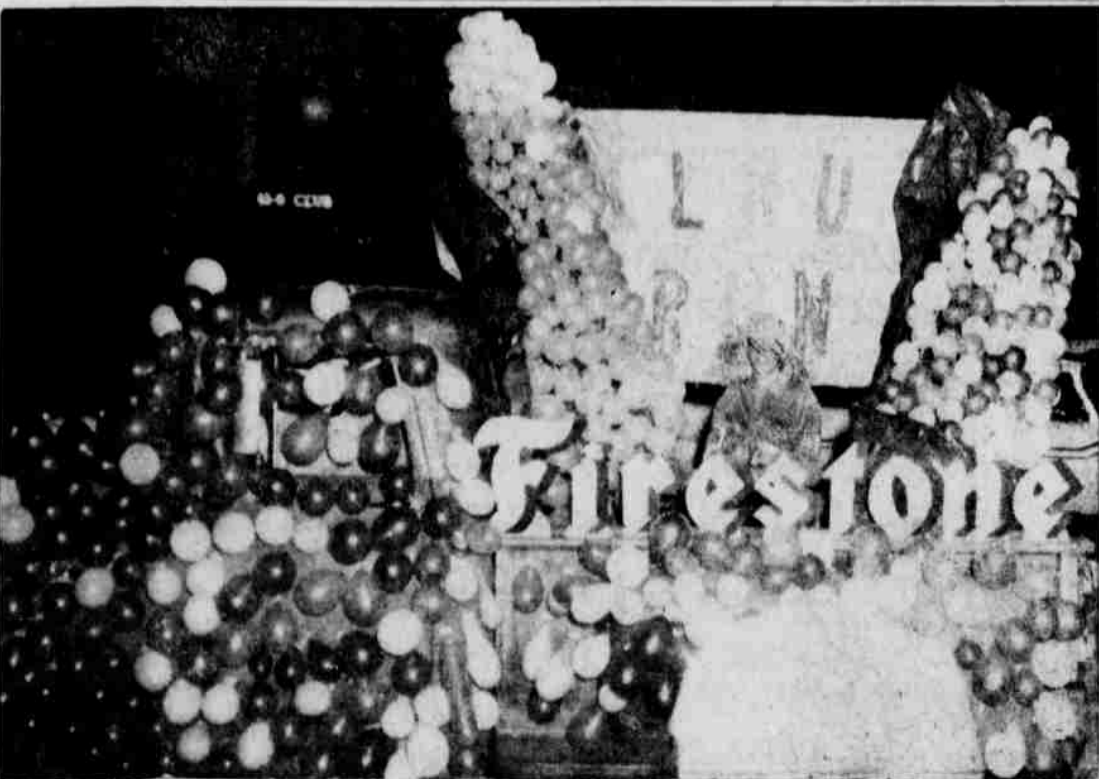
NO. 2 FLOAT —Linder Firestone Store was awarded second prize for its colorful float in the Merchants Parade, displaying two huge ears of corn with many-colored balloons as kernels.

"WHERE QUALITY COSTS LESS" Soennichsen's DEPARTMENT STORE