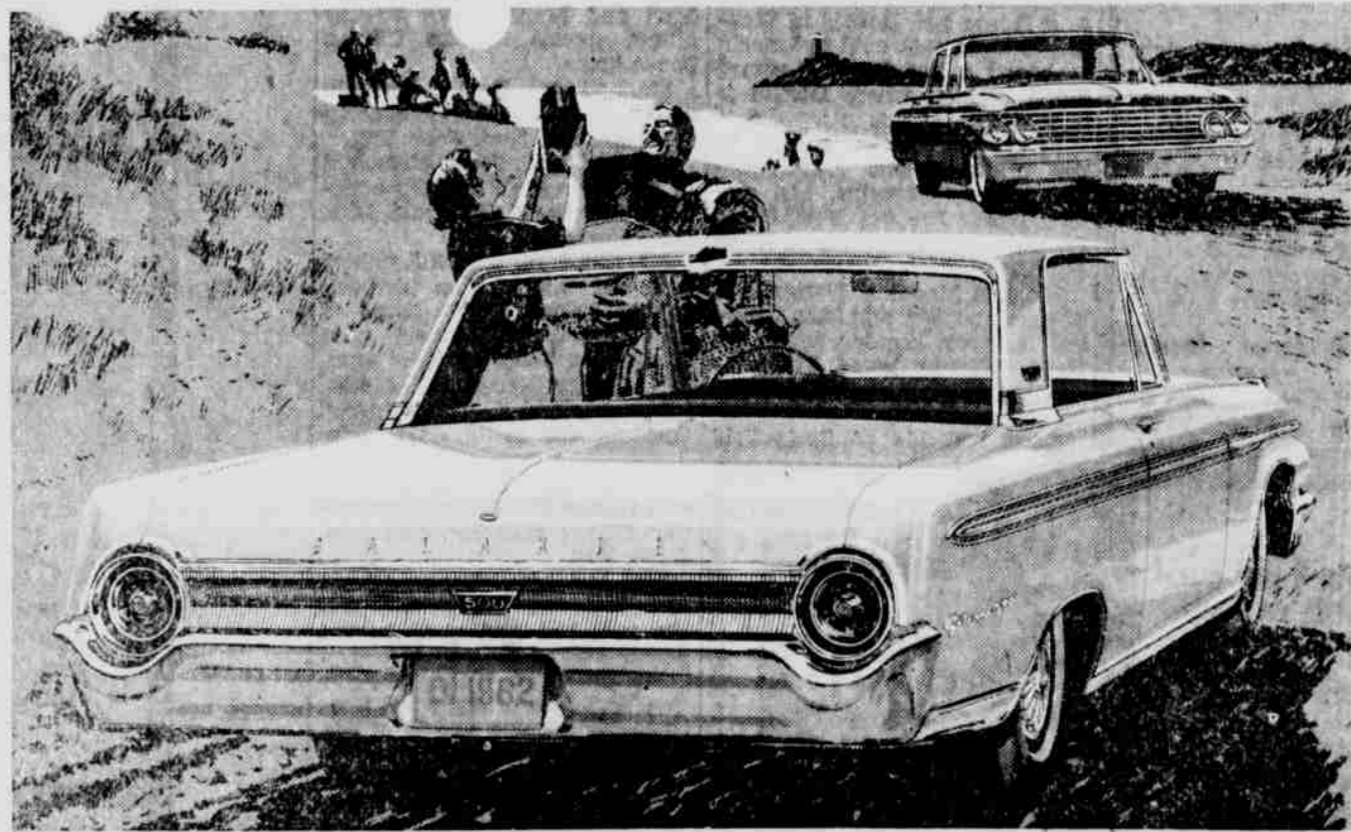
Galaxy 500 Club Victoria (foreground) GALAXIE TOWN SEDAN (background) The Galaxy 500—new in name, new in luxury—is for those who want all of the elegant extras. The 1962 Galaxy makes it easier than ever to move up to true luxury—at the low Ford price. All Galaxies are beautifully built to be more service-free. They go 30,000 miles between major lubrications, 6,000 miles between oil changes and minor lubrications. Brakes adjust themselves automatically.

compromise, look to America's favorite compact: this year there are more Falcons than ever to choose from—13 in all. Wagon fanciers will find unprecedented variety—from a new wagon that seats eight to a Falcon Squire Wagon with the rich woodlike finish of the famous Country Squire. Pick the Ford in your future with this confidence: every 1962 Ford is built to a standard of quality so high that it will change all your ideas of how fine, how quiet, how enduring a car can be.