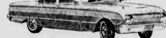
FALCON FORDOR SEDAN... Just one of 13 Falcons for 1962, this Falcon sedan has an improved version of the Falcon Six engine that last spring recorded the best gas mileage for a six of eight in the 25-year history of the Michigan Economy Run.