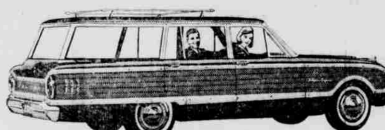
FALCON SQUIRE WAGON... Brand new for '62, it's sleek and sophisticated. Inside, it is available with Futura bucket seats and console! Outside, it has elegant woodlike steel side paneling.