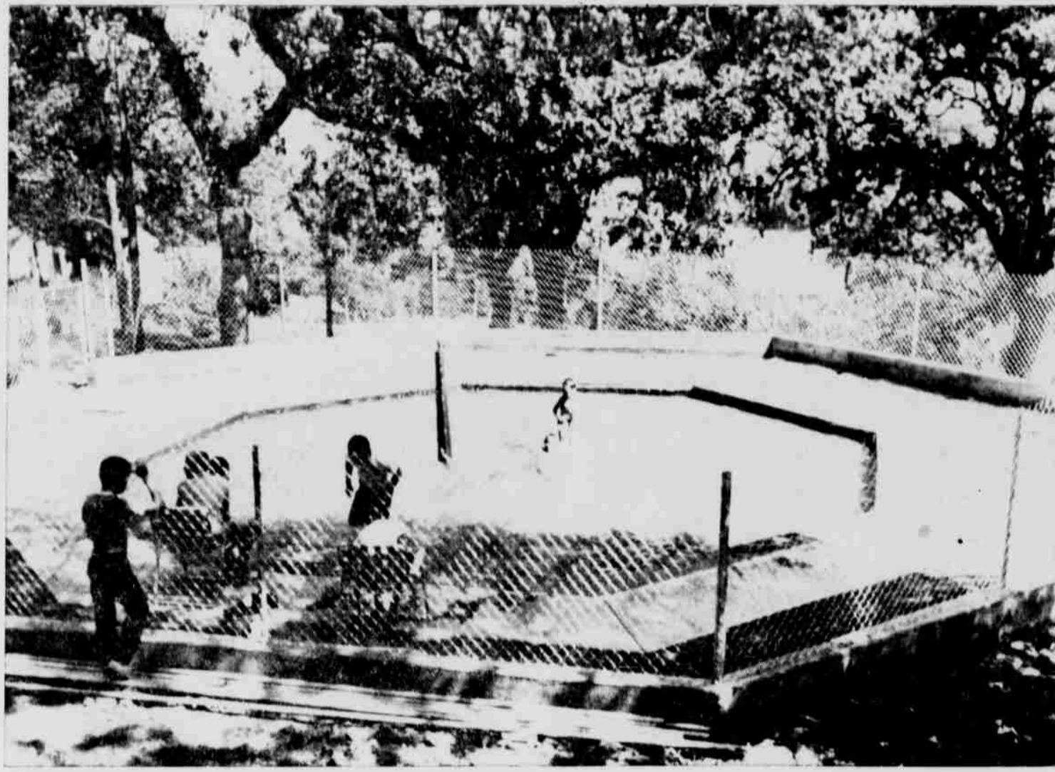
POOL TESTED —The new wading pool constructed at Garfield Park by the Plattsmouth JayCees was tested by youngsters for the first time Sunday on a perfect day for wading. The pool is complete, except for some finishing painting and final touches for

the fence surrounding it. Donations to the fund to pay for the materials used are still being taken through the Chamber of Commerce Office and The Journal will acknowledge all contributions.