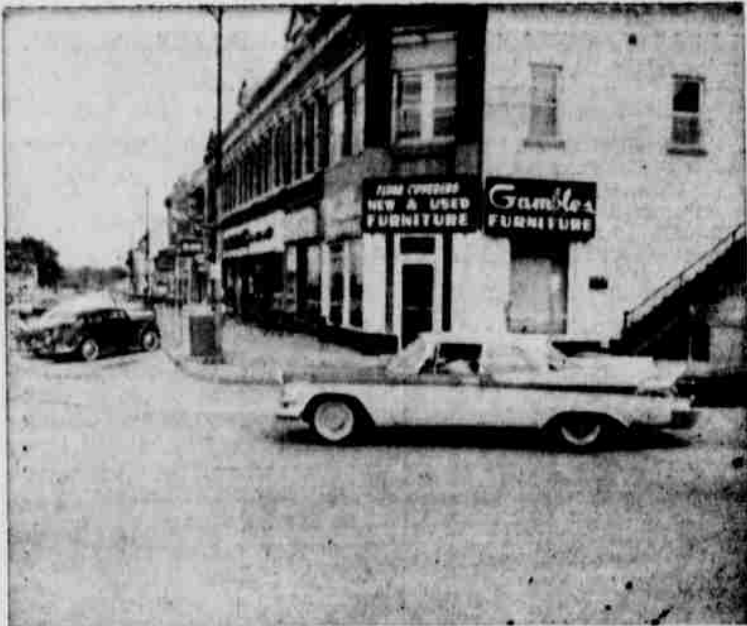
GAMBLES FURNITURE —The new Gambles Furniture Store is located on the southeast corner of 6th and Main next door to Consumers Public Power. Grand "expansion" opening is Friday. (See sale ad in this edition).