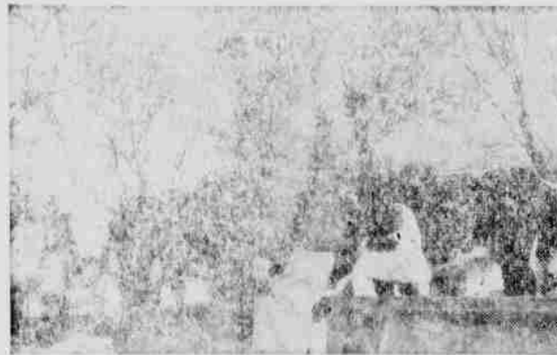
Cariton Noyes, Valley, Nebraska, with some of the 876 steers that averaged 3.24 pounds per day gain in his custom feedlot.

String of 876 Oklahoma steers average 3.24 pounds per day in Nebraska feed yards