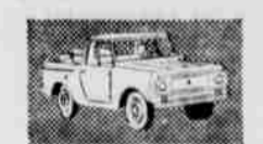
This is the Scout, a neat and nimble pickup. Small in size. Light in weight. Fun to drive for business or pleasure.

engine provides husky power, saves gas and oil. Optional all-wheel drive provides extra traction for work off-road, optional steel Travel-Top converts it into town delivery. There's never been anything like the Scout.