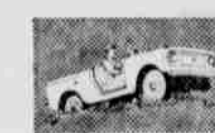
Same Scout stripped for action. For special duty, doors, windows lift off, windshield folds down or detaches.