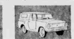
Same Scout converted to town delivery by an optional steel Travel-Top complete with windows and lift gate.

The Scout is INTERNATIONAL-built, backed by INTERNATIONAL service everywhere on every part. See us today and hit the trail to low-cost transportation!