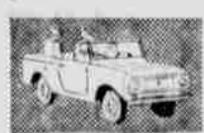
Same Scout with the roof rack. Top is removed in minutes. To give you a vehicle for any kind of activity.