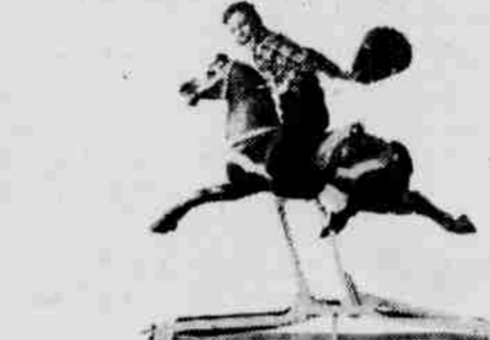
EXTRA PEP. Up to 10% more pickup than even last year's brilliant Mercury. Mercury's super-powered engines do the exceptional with matter-of-fact ease.