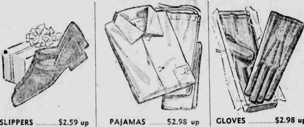
SLIPPERS .....$2.59 up PAJAMAS .....$2.98 up GLOVES .....$2.98 up