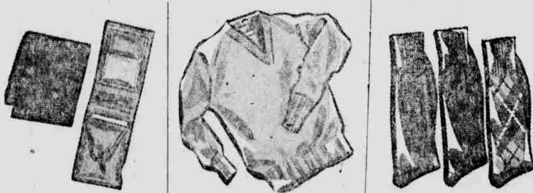
WALLETS .....$2.98 up SWEATERS .....$3.29 up SOCKS .....55c up