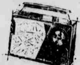
GE TRANSISTOR RADIO 8 books