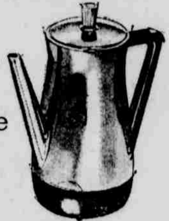
WEST BEND PERCOLATOR 4 books

Get Christmas gifts FREE for Top Value Stamps