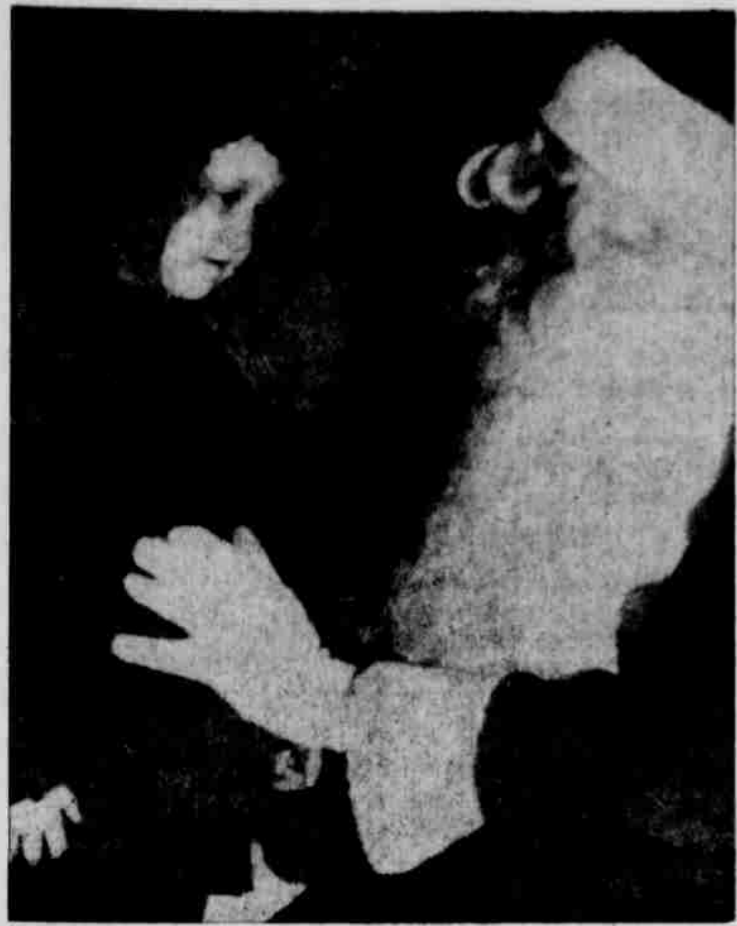
SANTA'S CANDID CAMERA —Santa is greeting hundreds of youngsters like this little girl here. Santa Land is open nightly at the Chamber of Commerce Office on Main Street from 7 to 9, except Sundays, through Dec. 23.