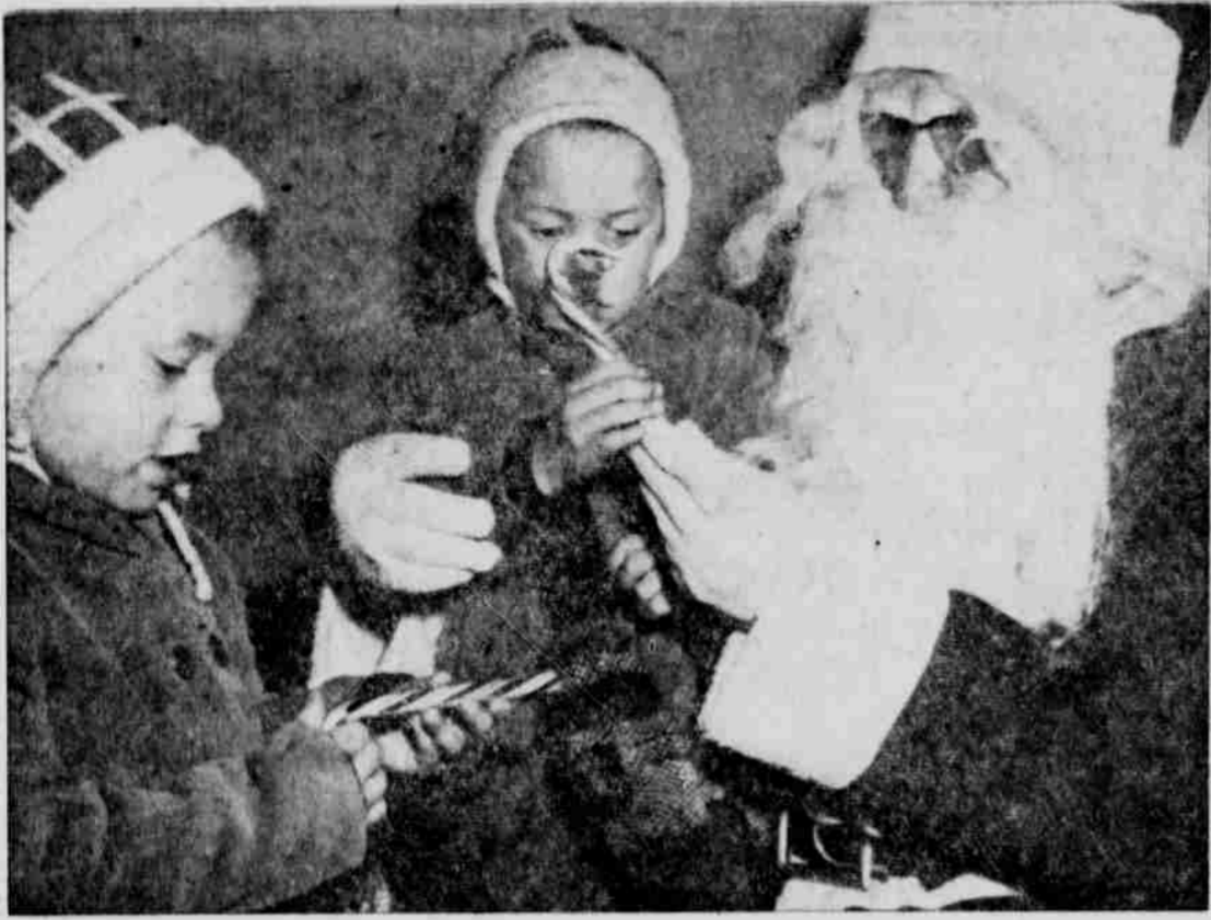
SANTA'S CANDID CAMERA —Dealing with Street. He just makes double promises and that's twin boys is no problem for Santa at Santaland that. Naturally, it's up to parents to take it up in the Chamber of Commerce office on Main from there.

THE PLATTSMOUTH, NEBRASKA, SEMI-WEEKLY JOURNAL PAGE EIGHT Thursday, December 8, 1960