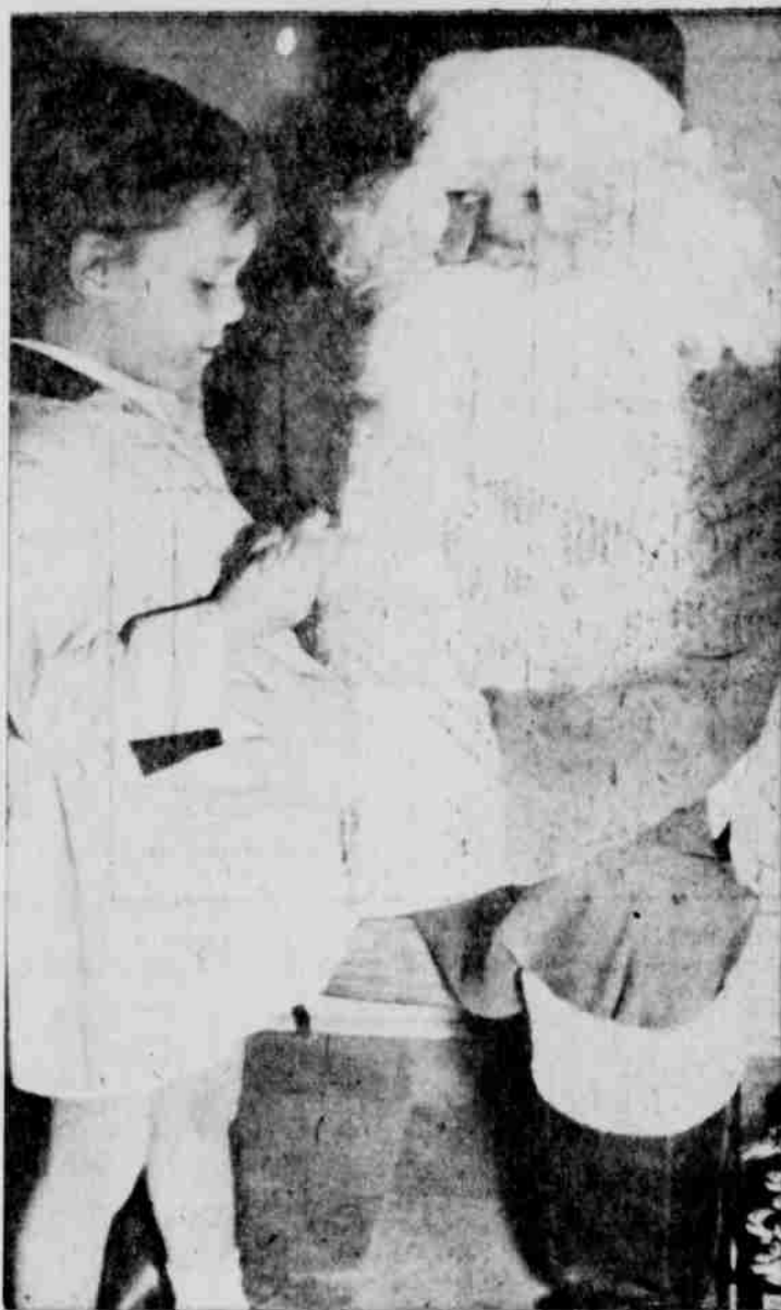
WEIGHTY DECISION —It was a serious moment when Santa asked, "And what do you want for Christmas?" here at Santaland. The little girl gave the matter some deep thought before giving the all-important answer (it's a secret, of course).