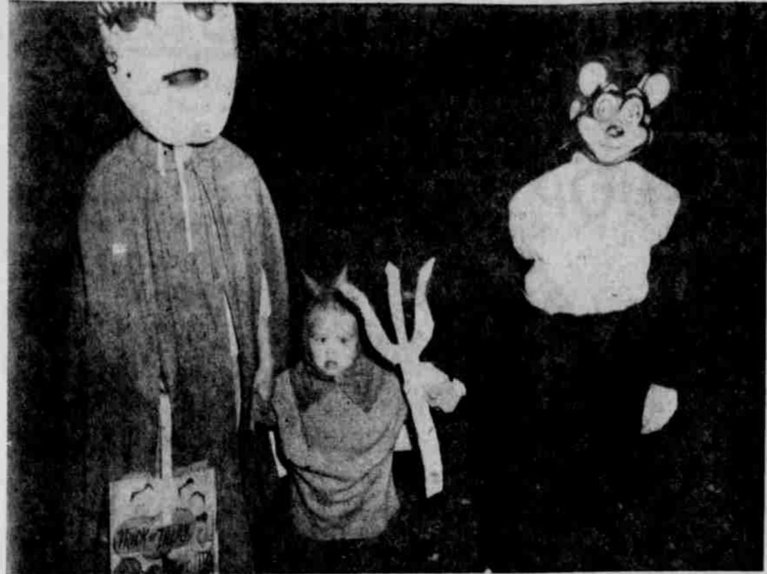
TRIO — A strange trio among tricks-or-treaters here Monday night were the long-lashed miss, Andy Panda and the youngster at center. The picture below identifies him.