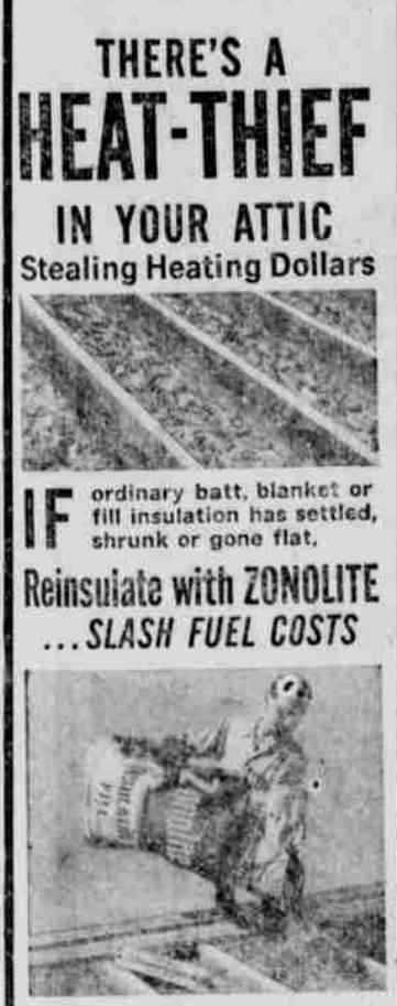
u'll never have to do that job again when you insulate with permanen-tonolite. Just pour it over old insu-ation, level it, leave it. op in and learn how