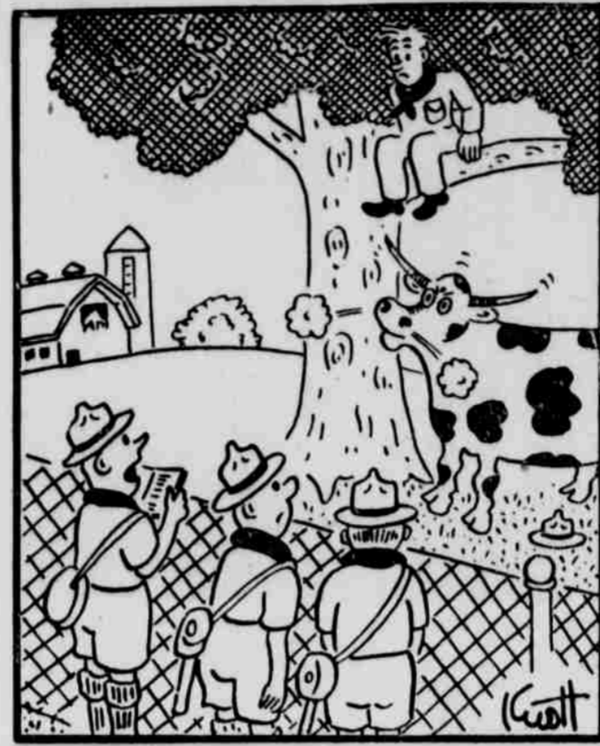
"THIS SITUATION ISN'T COVERED IN THE HANDBOOK, MR. HIGGINS."