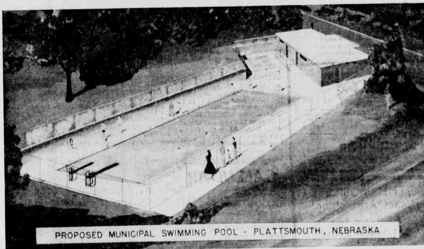
PROPOSED MUNICIPAL SWIMMING POOL - PLATTSMOUTH, NEBRASKA

NOTE: SURVEY OF SWIMMING POOLS IN SIMILAR COMMUNITIES INDICATES THAT OPERATING AND MAINTENANCE COSTS ARE PAID FOR OUT OF REVENUE. THUS — NO DEFICIT WOULD ACCRUE.