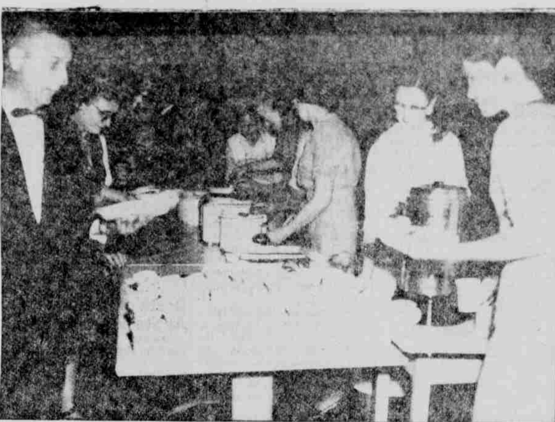
CROW LINE — Chamber of Commerce women served the dinner for Monday night after spending most of the day setting it ready and several days preparing for the event.