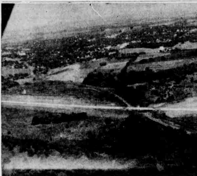
NEW LAKES — The aerial views above were taken by the Soil Conservation Service recently. They show two of the new flood control dams built here and the lakes that have formed behind them. In the left-hand photo, Dam 10-A in west Plattsmouth, christened the Hill City Project, is shown at upper left center. It lies just east of the Missouri-Pacific railroad tracks which

Sunday a number of the local lovers of trap shooting gathered at the Riverview range near the Platte river for a practice shoot. There were some thirty out to try their skill on the range and some very good records were set. The event caused a great deal of enthusiasm among the participants and another practice shoot is planned for Sunday, Sept. 27. The Lions club is considering a trophy shoot in the near future at the Riverside range.