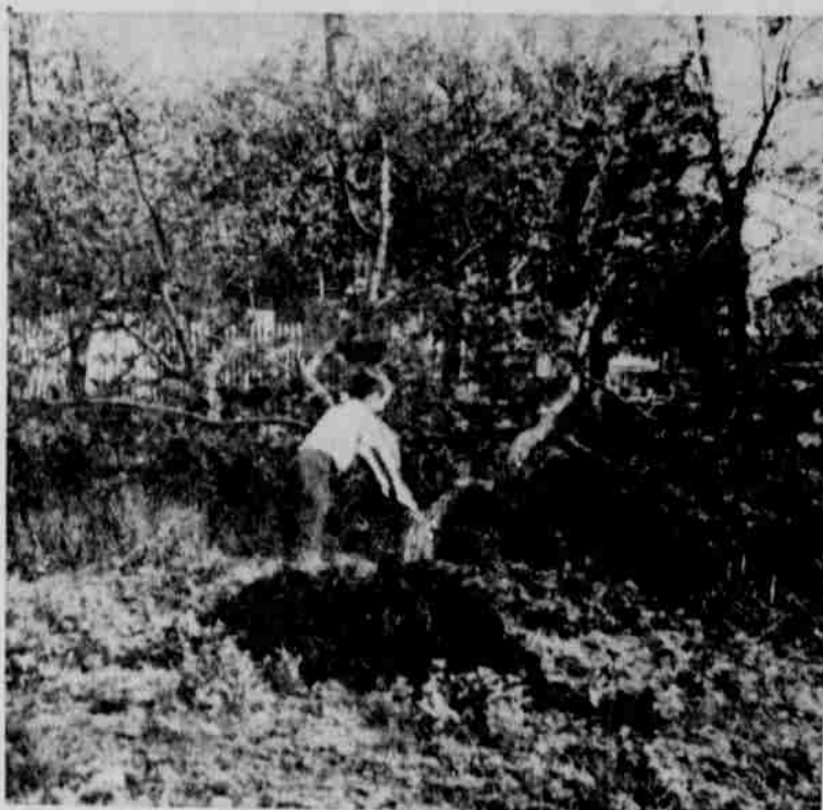
PLUM TREE PLUMB DOWN — Saturday's big wind broke a number of tree limbs but down on Lincoln Avenue it gave an extra huff and puff and uprooted (of all things), a full grown plum tree located in the yard of the Harold Austins. A top out of a large shade tree landed on the Austin trailer house but did no appreciable damage.