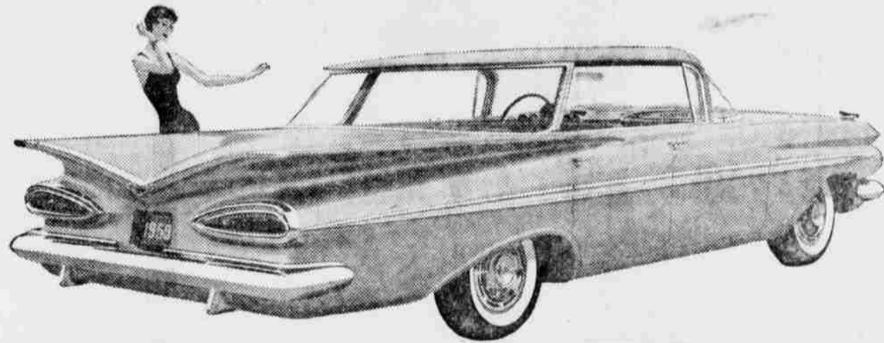
The bright new Bel Air 4-Door Sport Sedan with the same fine, fresh body styling as the most luxurious Chevrolets.

Visit your Chevrolet dealer's OPEN HOUSE (January 22 through 24)