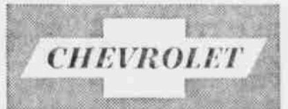
The smart switch is to the '59 Chevy!

Here's the latest addition you'll find at your Chevrolet dealer's Open House January 22 through 24. It's a new 4-door sport sedan in the Bel Air series—and it sports a lower price tag than any other Chevy hardtop. Bring the family and look it over. And get the full story on all the other striking models now available. Remember, production is rolling and you can count on prompt delivery! Just wait till you see what's waiting for you—a glittering constellation of sleek-lined exciting new Chevrolets in a wide choice of colors, models, engines and drives. The spotlight will be on the new Bel Air 4-door hardtop—and you'll want to check its ultra-reasonable price against any other hardtop. When you do—and when you see how much more Chevrolet gives you in styling, in extra-roomy Bodies by Fisher, in the super-softness of Full Coil springing, in Easy-Ratio steering—then you'll know that this is the happiest surprise of the year. Come on in; don't miss this Open House!